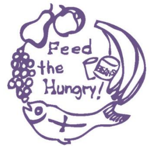
Rome Area Hunger Walk

The money raised by the RAHW is shared among the following agencies: Bill Gavin Food Pantry at St Joseph's in Lee Center; Bread of Life, Catholic Charities of Rome; Foothills Rural Ministries; Mission of the Christ Child; Salvation Army and Rome Rescue Mission. All services are provided without regard to race, gender, or religious affiliation. Additional details to follow! Thank you in advance for your support!!